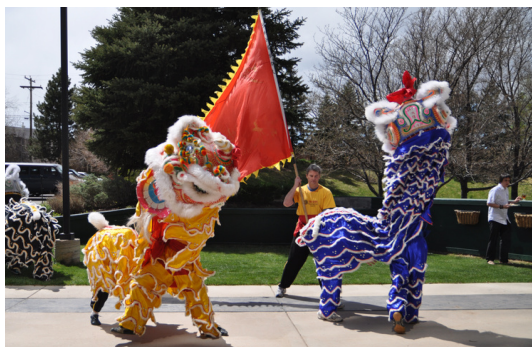
Photo from the CSTCM 20th Anniversary Celebration

Healthy Fit Info - http://healthyfit.info/